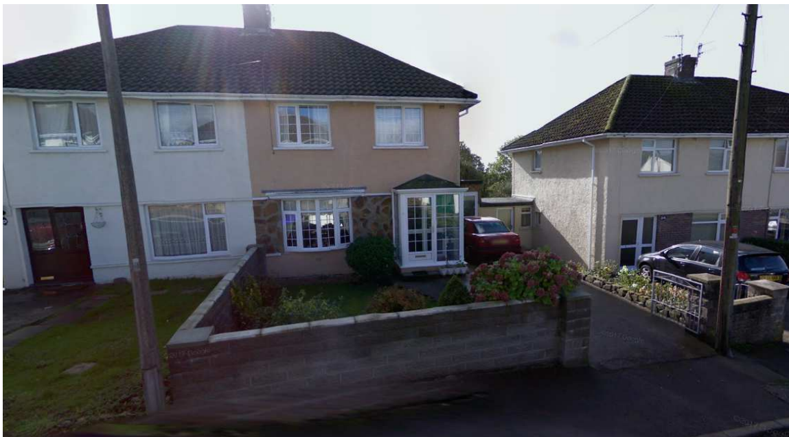
Streetscene View of 26 Heol y Mynydd

The site itself comprises a semi-detached, two storey property which faces north. The dwelling is positioned forward of the centre of the residential plot of around 300 square metres, adjacent to the eastern boundary of the application site and 28 Heol Cambrensis. The land slopes gently from east to west.